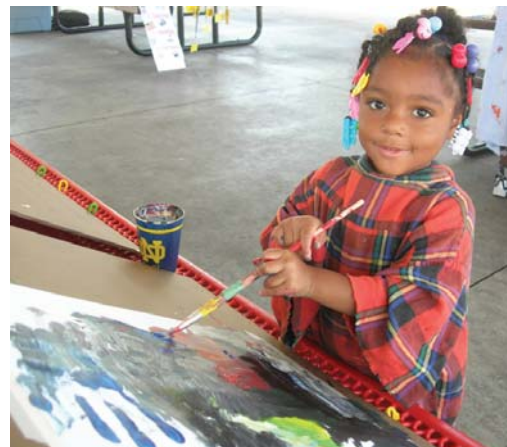
One of the many great activities at ASAP Summer Arts Camp