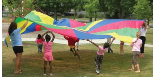
For more photos please visit www.stjohnsdsm.org