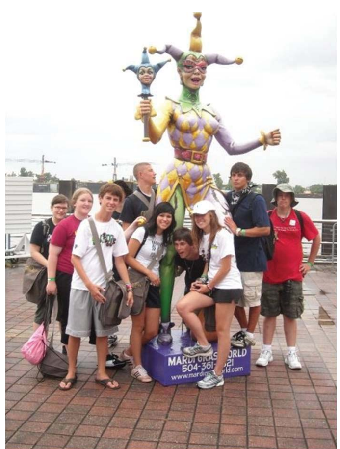
Members of St. John's at the ELCA Youth Gathering in New Orleans.